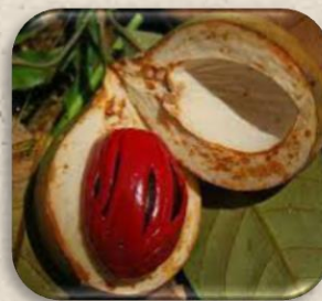
purple-brown shiny seed