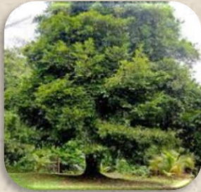
thickly branched with dense foliage

The fruit is محصور شده encased in a پوسته گوشتی fleshy husk. When the fruit is ripe, this husk splits into two halves 2 along a توری شکل ridge running the length of the fruit. Inside is a پوشش زرشکی purple-brown shiny seed, 2–3 cm long by about 2 cm across, surrounded by a توری شکل lacy red or crimson covering called an 'aril'.