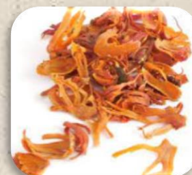
Mace reddish seed covering

preservative: a chemical substance that is used to prevent things from decaying, for example food or wood