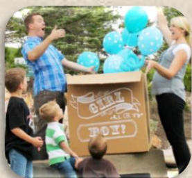
GENDER REVEAL IDEAS

Mace is a yellowish-brown spice we obtain from the reddish seed covering of the nutmeg