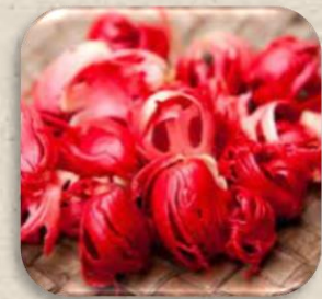
lacy red or crimson covering

encased in: to cover or surround something completely His broken leg was encased in plaster.