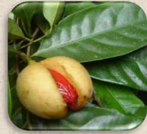
fruit is encased in a fleshy husk