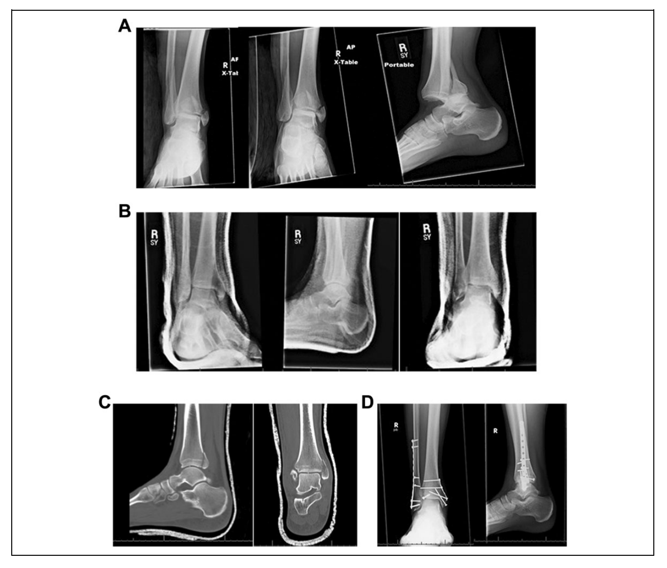
Figure 2. (A) Trimalleolar ankle fracture dislocation. (B) Postreduction and splinting radiographs. (C) Computed tomography scan ordered to assess posterior malleolar fragment demonstrated retained intra-articular fragment. (D) Operative approach was tailored to address this fragment. Final ankle construct images are demonstrated.

proven utility, the use of preoperative cross-sectional imaging (CT or MRI) and arthroscopy for ankle fracture-dislocations remains surgeon dependent and a topic for future research. Similar experiences were previously reported in the setting of hip dislocations, where the morbidity associated with failure to discover concomitant injuries on plain radiographs has led to post–hip reduction CT becoming the standard of care.<sup>1</sup>