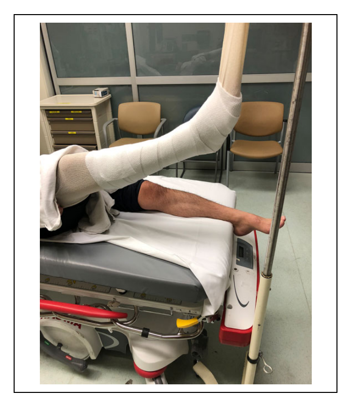
Figure 3. Modified Quigley maneuver for single-person reduction and splinting of ankle fracture-dislocations. Full technique described by Skelley and Ricci.<sup>49</sup>